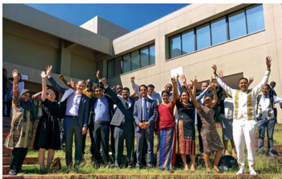
A previous PEPP cohort celebrate arriving on campus following their matriculation ceremony